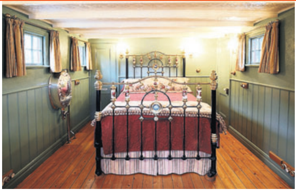
Rivers run... (from left) Hero, built in 1871 and relaunched in 2000 in Echuca, is now a bed and breakfast; the cabins have stayed true to the fashions of the 1800s.

More than 200 paddle steamers were built at Echuca-Moama, which is one of Victoria's oldest